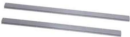
Stiffening rails for 1500 and 1800 tops

WARRANTY Motor 2 Years Components 5 Years