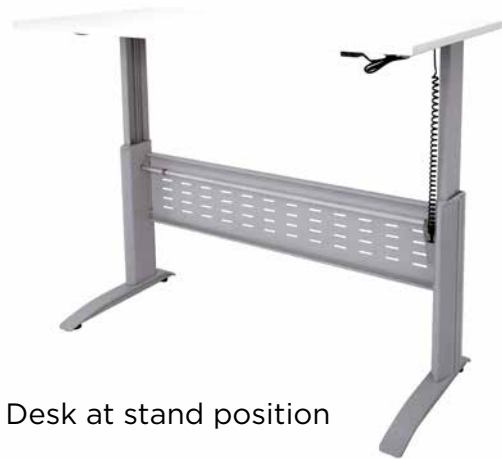
Desk at stand position